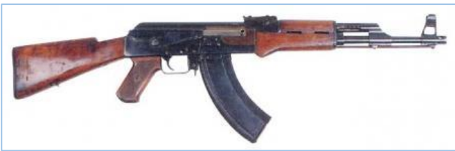
The experimental Kalashnikov assault rifle of 1947, second model