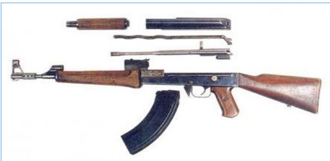
The experimental Kalashnikov assault rifle of 1947, first model disassembled