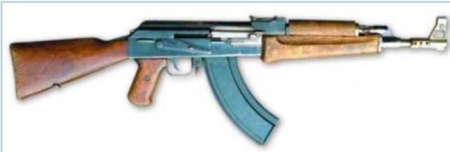
The experimental Kalashnikov assault rifle of 1947, first model