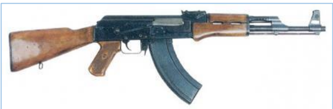
Early production Kalashnikov AK rifle, as manufactured between 1949 and 1951

Designed by Михаил Тимофеевич Калашников (Michail Timofeevič Kalašnikov), 1919-2013, Sergeant of the Central Scientific's Developmental Firing Range for Rifle Firearms of the Chief Artillery Directorate of the Red Army, then Lieutenant General.