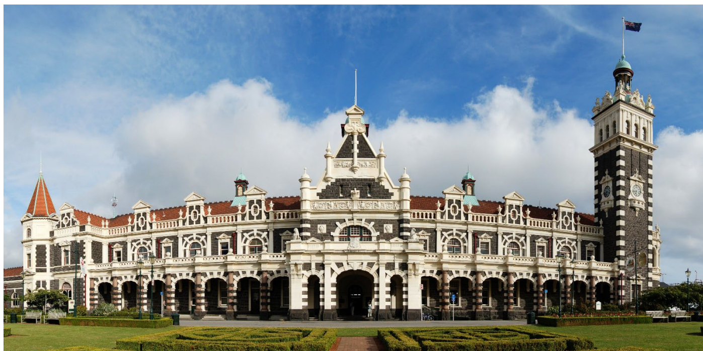
Figure: Dunedin railway station, New Zealand.

Time and place: 29 June - 5 July 2025 , Dunedin, New Zealand.